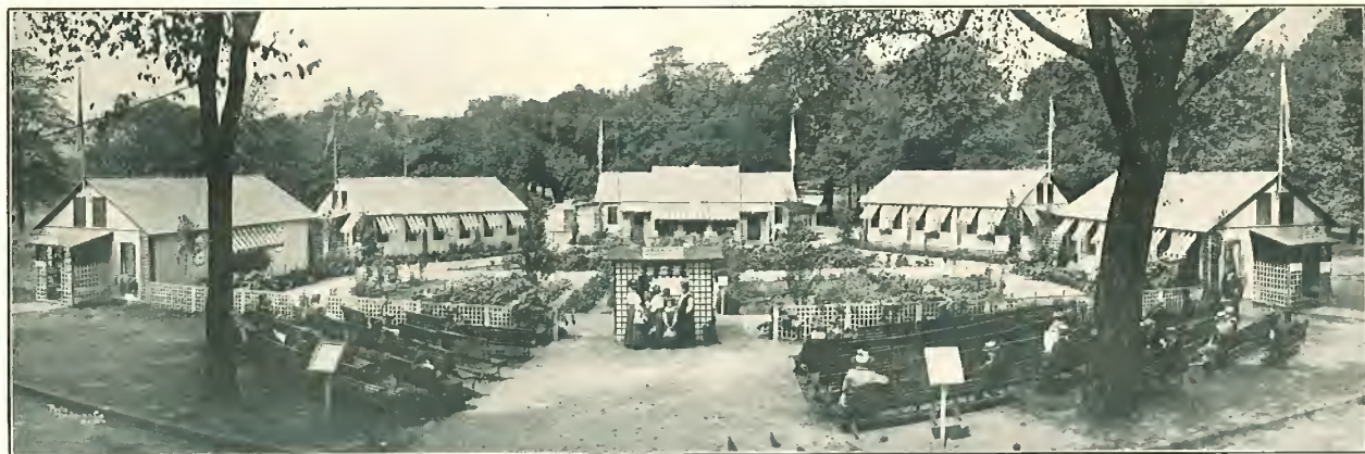
A Group of Hodgson Portable Houses used by Mass. Public Safety Committee on Historic Boston Common